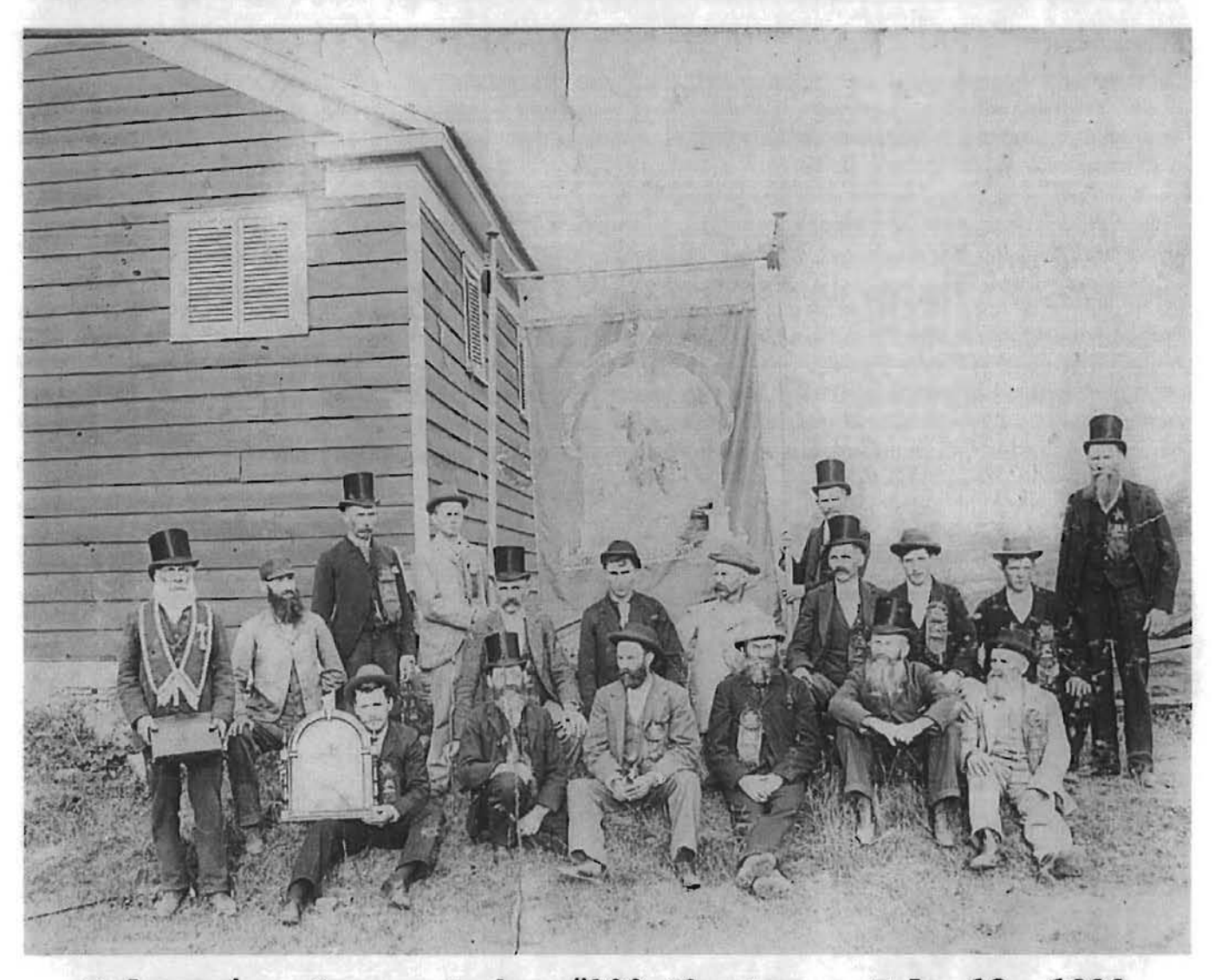
Dulcemaine Orange Lodge #100 Charter - July 12, 1898 (see Pg. 12)